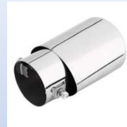
Muffler - Resonator tubes